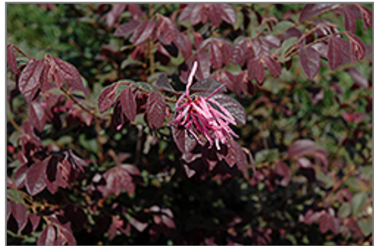
Sizzling Pink Chinese Fringeflower flowers

Sizzling Pink Chinese Fringeflower is recommended for the following landscape applications;