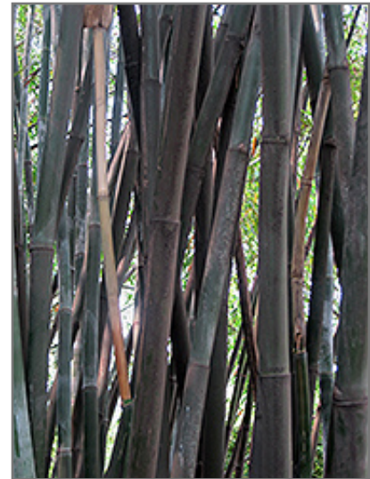
Chinese Goddess Bamboo bark

Chinese Goddess Bamboo is recommended for the following landscape applications;