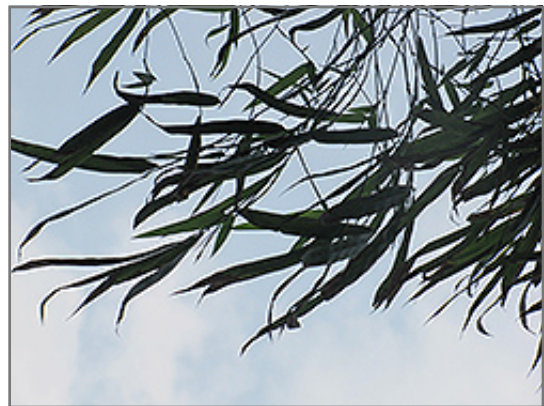
Chinese Goddess Bamboo foliage