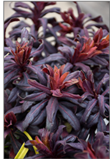
Ruby Glow Wood Spurge flowers

Ruby Glow Wood Spurge is recommended for the following landscape applications;