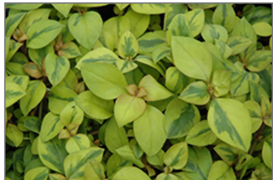
Walkabout Sunset Loosestrife foliage