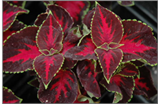
Chocolate Covered Cherry Coleus foliage