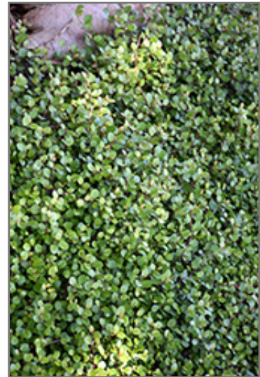
Creeping Wire Vine