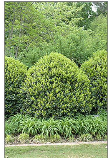
Needlepoint Chinese Holly