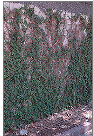
Creeping Fig