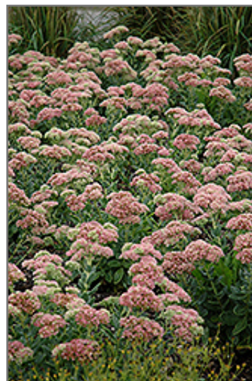
Autumn Joy Stonecrop in bloom

Autumn Joy Stonecrop is recommended for the following landscape applications;