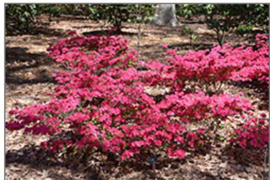
Hinode-giri Azalea in bloom