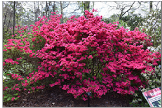
Hinode-giri Azalea in bloom

This shrub does best in full sun to partial shade. It requires an evenly moist well-drained soil for optimal growth, but will die in standing water. It is very fussy about its soil conditions and must have rich, acidic soils to ensure success, and is subject to chlorosis (yellowing) of the leaves in alkaline soils. It is somewhat tolerant of urban pollution, and will benefit from being planted in a relatively sheltered location. Consider applying a thick mulch around the root zone in winter to protect it in exposed locations or colder microclimates. This particular variety is an interspecific hybrid.