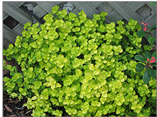
Golden Oregano

Aside from its primary use as an edible, Golden Oregano is suitable for the following landscape applications;