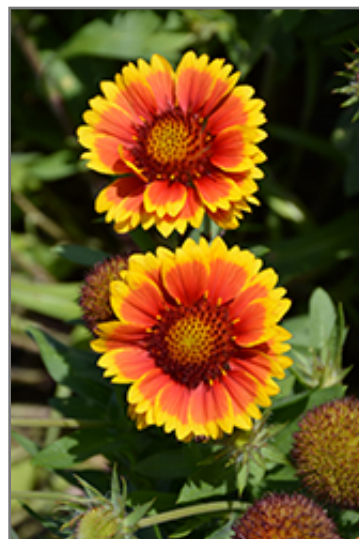
Arizona Sun Blanket Flower flowers