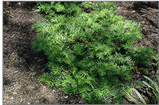
Prostrate Japanese Plum Yew