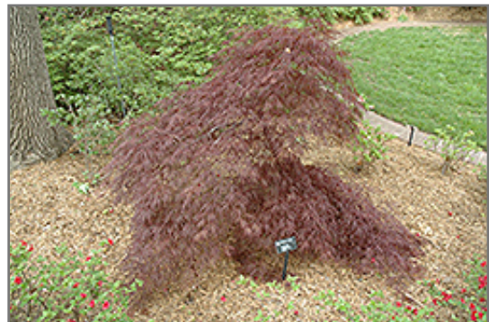
Purple-Leaf Threadleaf Japanese Maple