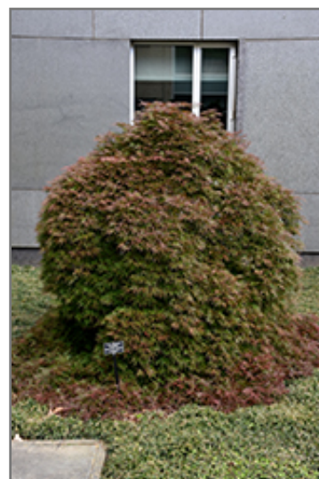
Orangeola Cutleaf Japanese Maple