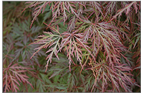
Orangeola Cutleaf Japanese Maple foliage

Orangeola Cutleaf Japanese Maple will grow to be about 8 feet tall at maturity, with a spread of 8 feet. It tends to be a little leggy, with a typical clearance of 2 feet from the ground, and is suitable for planting under power lines. It grows at a slow rate, and under ideal conditions can be expected to live for 60 years or more.