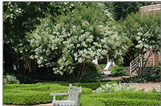
Natchez Crapemyrtle in bloom