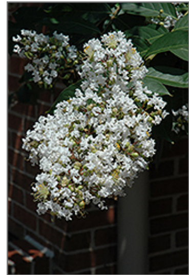
Natchez Crapemyrtle flowers

This is a relatively low maintenance tree, and is best pruned in late winter once the threat of extreme cold has passed. Deer don't particularly care for this plant and will usually leave it alone in favor of tastier treats. It has no significant negative characteristics.